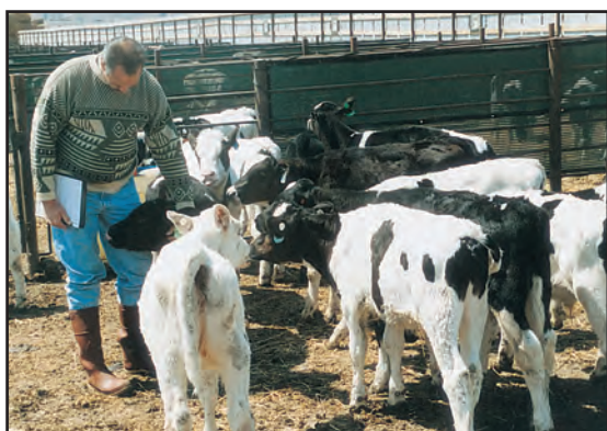
ACCLIMATING HEIFERS TO PEOPLE in this pen may help them to grow up into calmer, more productive cows.

Cows and other animals tend to develop fear memories which are linked to either bad places or prominent objects. Animals are most likely to