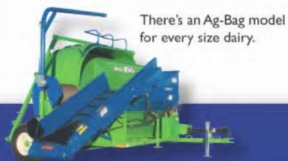
There's an Ag-Bag model for every size dairy.

New! X1114 Professional Highest capacity silage bagger available. Fills 14' bags up to 500'.