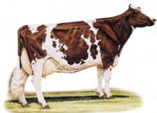
Red & White